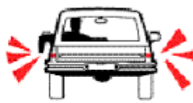
Stop or Slow Down

Signal before changing lanes. An illegal lane change ticket will cost you.